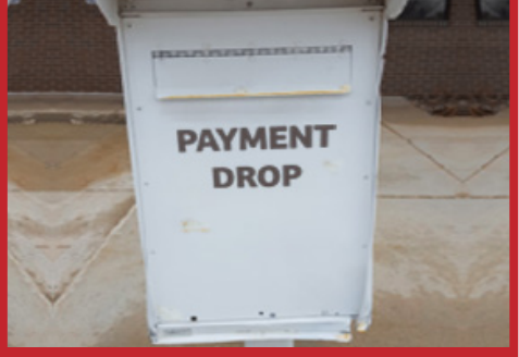
Basic Designs, Minimal Customization