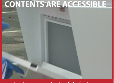
Lacking important safety features