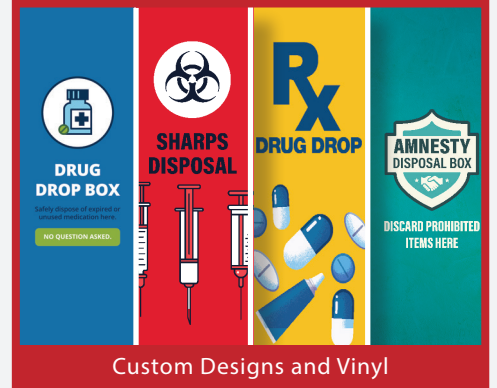
Custom Designs and Vinyl