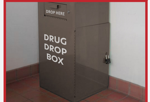
Basic Designs, Minimal Customization