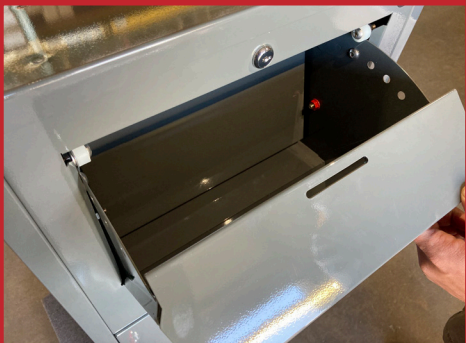
Restricted Hopper Opening